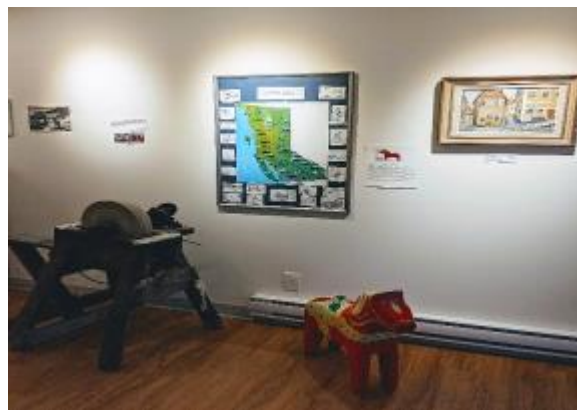
Wet Grindstone 1890s, L. Österlind Map of Swedes in B.C.'s settlements and painting of the Old City of Stockholm