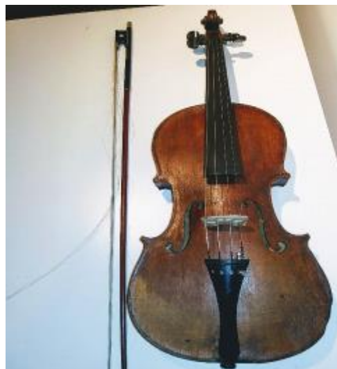
Swedish folk music accordion & violin ca 1890s Birchbark horns