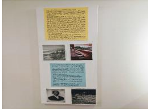
Swedes in BC Railroad