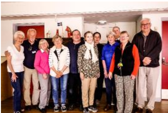
Swedish Heritage Committee members and volunteers in front of kitchen area and office door

In 2018, the committee had applied for a $ 5000.00 grant for electronics through New Horizons and in May we learned that the grant was approved. SHBC purchased a laptop with programs such as Publisher, Photoshop and Microsoft Word.