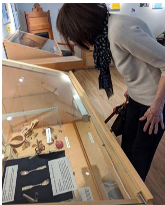
A visitor during Semlor Membership day