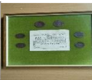
C.P. tokens ca 1725