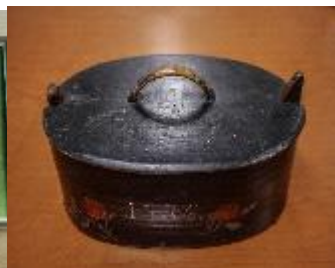
Lunch box 1786