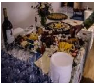
Delicious Refreshment Donated by Swedish Canadian Village