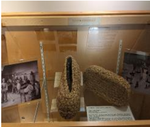
Straw shoes for men, women and kids 1809