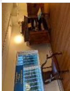
Cabinet and thank you donor sign