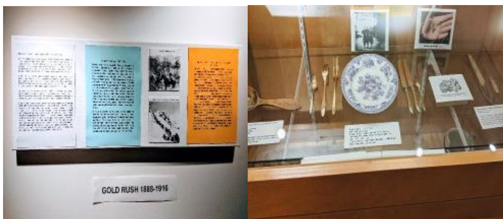
Swedes in BC Gold rush 1888 -1916 Dirigold, gold nuggets in BC Fishnet needles