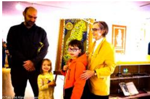
Three generations of Swedes in B.C. in front of the interactive Sweden Map

We had 49 visitors go through the Swedish Heritage Room that day