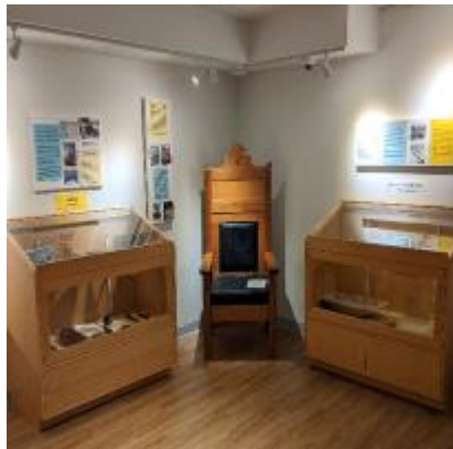
Vasa order meeting chair