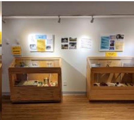
View of our displays

Invitations for our opening event was sent to all members and artifact donors