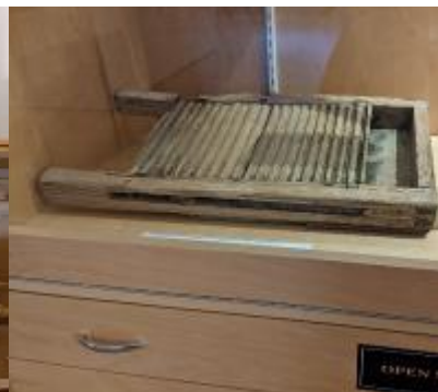
Wooden washboard ca 1800