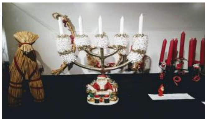
Gotlands candle holder and straw horse

We planned monthly displays for Swede of the Month and we started with Sven Börje Johansson a Reindeer herder and captain during the first Northwest passage from the Pacific to the Atlantic Ocean. We were closed during the month of December.