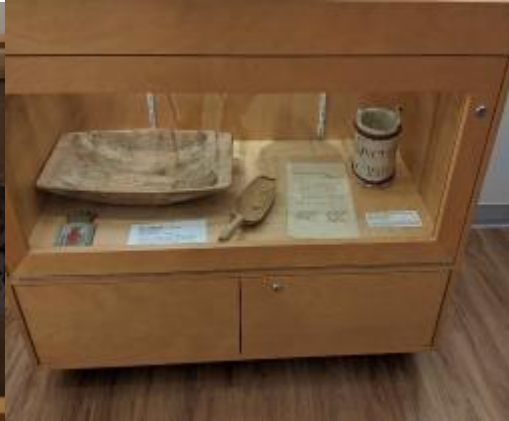
Wooden baking trough & Container