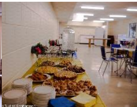
Homemade Fika cookies and buns