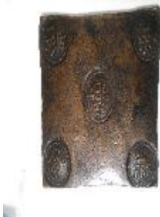
1 Daler copper plate money